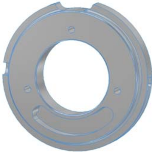
Original vacuum valve (small opening).