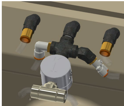
Discontinued Design C48925